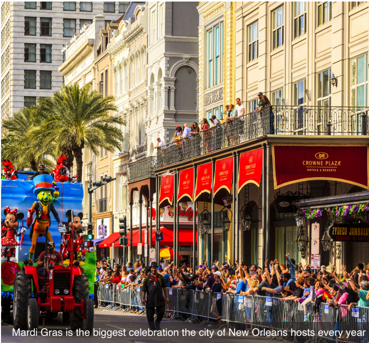
Mardi Gras is the biggest celebration the city of New Orleans hosts every year