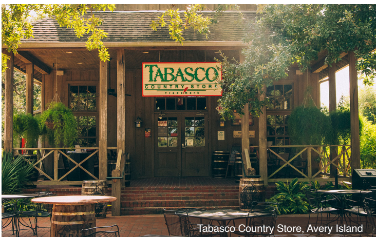
Tabasco Country Store, Avery Island

DAY 6 Travel Home: After breakfast, a group transfer to the New Orleans Airport is available for flights out after 12:00 p.m. Meal: B