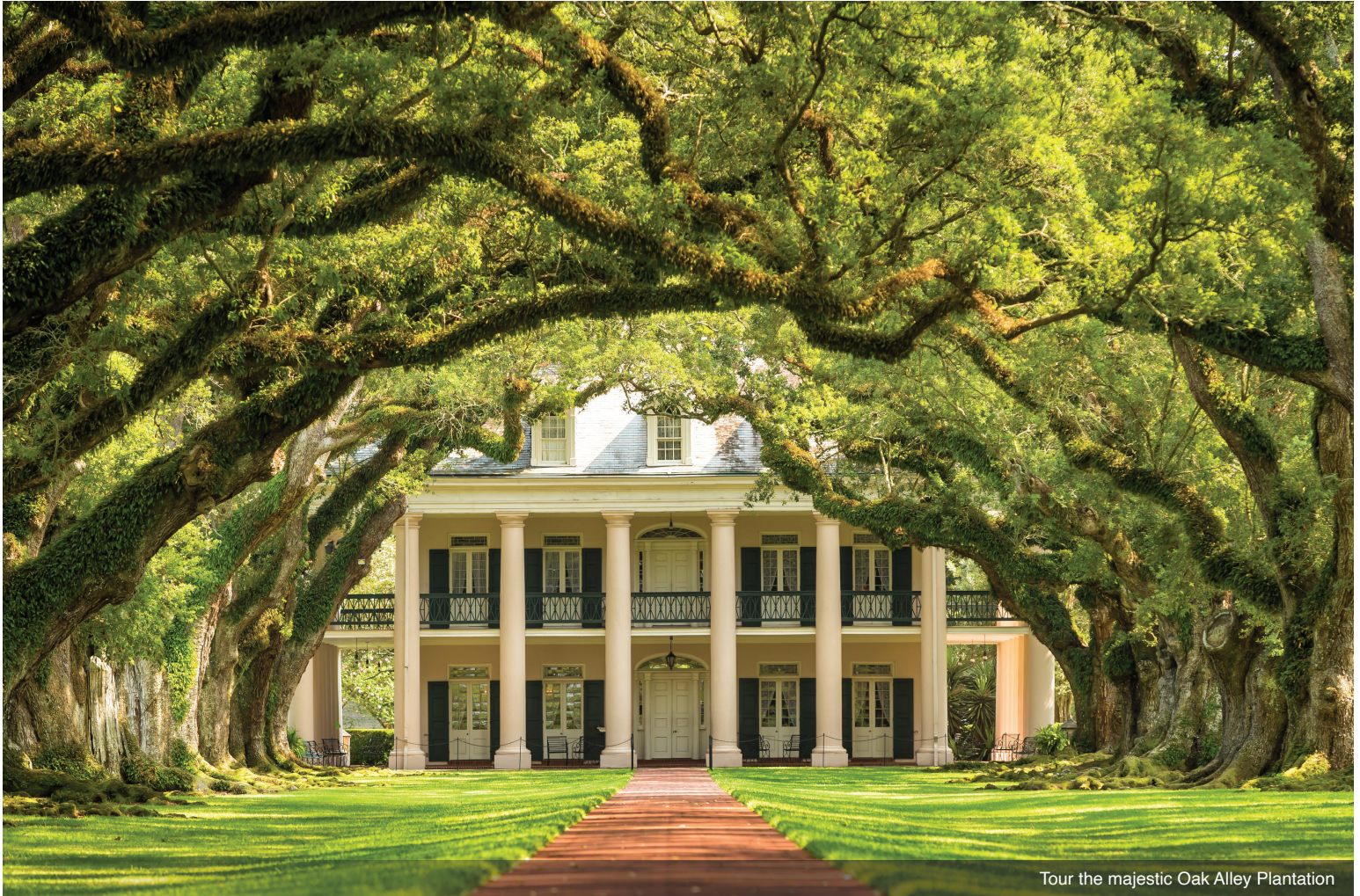
Tour the majestic Oak Alley Plantation