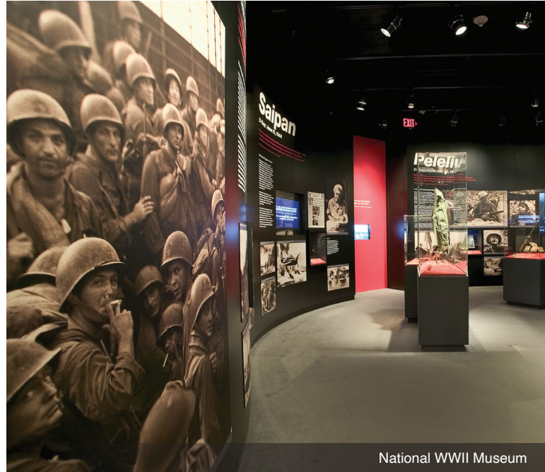
National WWII Museum

DAY 1 Arrive in New Orleans: Welcome to New Orleans, Louisiana, America's jazz capital. Meet your Tour Manager in the hotel Lobby at 6:00 p.m. for a transfer to our welcome dinner and cooking demonstration at the New Orleans School of Cooking. Located in a renovated molasses warehouse in the heart of the French Quarter, you will learn the basics of Louisiana cooking from well-known local chefs. Creole/ Cajun experts teach New Orleans specialties such as Gumbo, Jambalaya and Pralines, and season them with history, trivia and tall tales. You'll be treated to a wide range of local classics and get to enjoy them in sumptuous feast. It's a "ga-ron-tee'd" good time for all. After dinner, feel free to enjoy the French Quarter on your own. Meal: D